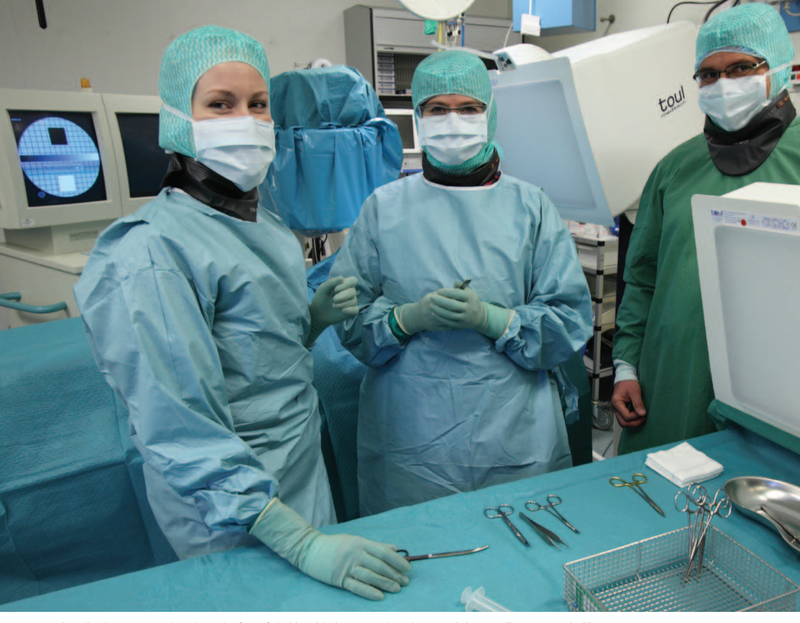
Toul Meditech guarantee ultra-clean air of \leq 5cfu/m<sup>3</sup> in critical areas, such as the wound site as well as over surgical instruments.