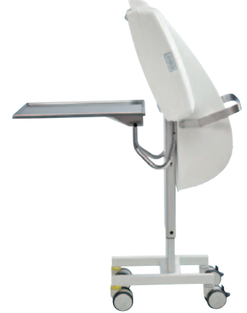
Operio Mobile is our mobile sterile air zone unit for effective protection of the wound site.

SteriStay is our surgical instrument table with ultraclean laminar airflow for effective protection of the instruments during setup and throughout surgery.