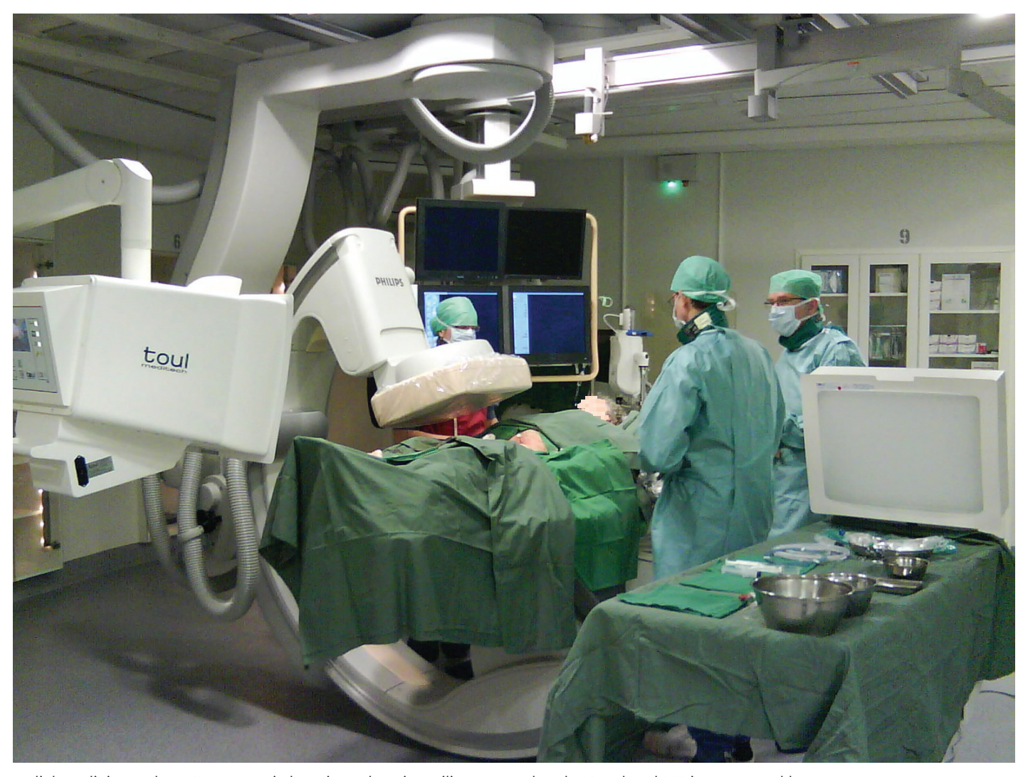
Radiology clinic at Kalmar County Hospital: angiography using ceiling-mounted Toul 200 and Toul 300 instrument table.