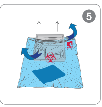
5. Remove instruments before reprocessing

4. Transport Duck Bag<sup>™</sup> from OR to CS