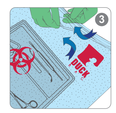
3. Close seal to ensure humid environment during transport and storage