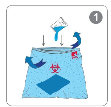
1.Empty contents of 4-Zyme sachet into Duck Bag™