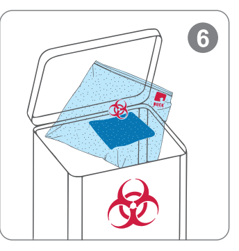
6. Discard used Duck Bag™ and reprocess instruments according to manufacturer's instructions for use